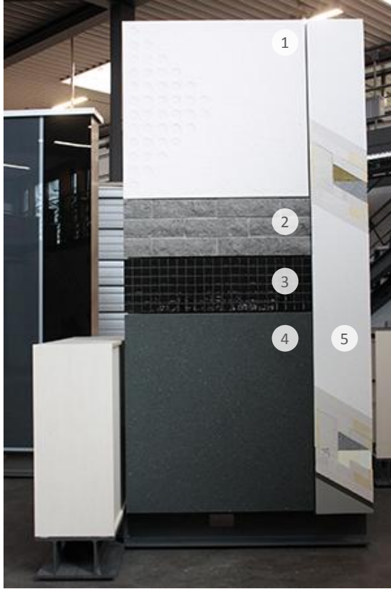
Vorderansicht Front elevation