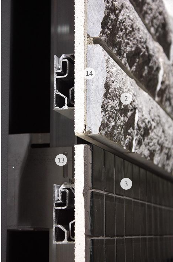
Detail Unterkonstruktion Substructure detail