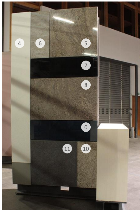
Rückansicht Rear elevation